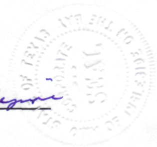
Howard Gillespie, Mayor Ingleside on the Bay